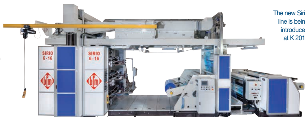
The new Sirio line is being introduced at K 2016

The unwinding unit is provided with hydraulic loader for reels and motorized tension control. Each printing group is equipped with motorized printing cylinder, electrical ink grinding, and pneumatic ink-